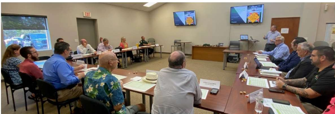
Stakeholder Group for the Vulnerability & Risk Assessment Study for Transportation Infrastructure (2023)

Lecanto Government Building 3600 W. Sovereign Path, Room 166 Lecanto, Florida 34461 Time: 9:00 a.m.