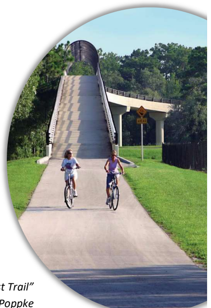
"Bicycling on the Suncoast Trail"