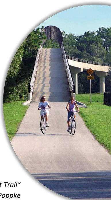
"Bicycling on the Suncoast Trail"