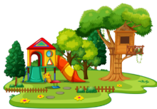
Parks & Recreation