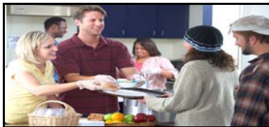
PEOPLE HELPING PEOPLE OF HERNANDO COUNTY